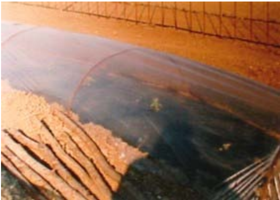
MARROWS DAMAGED BY FROST (- 5°C)