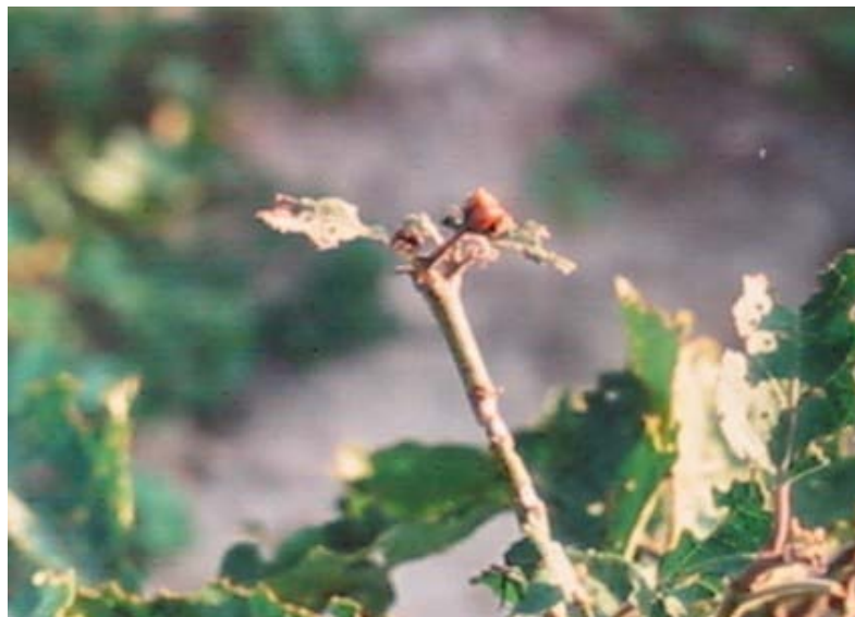
AUBERGINE DAMAGED BY DORYPHORA