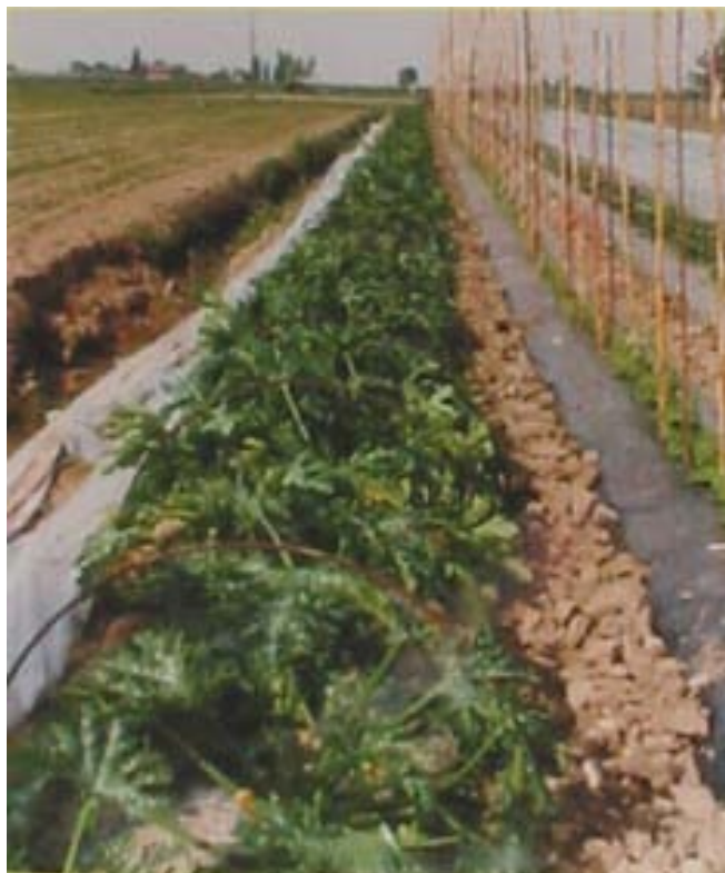
AFTER THE HOMEOPATHIC SPRAYS