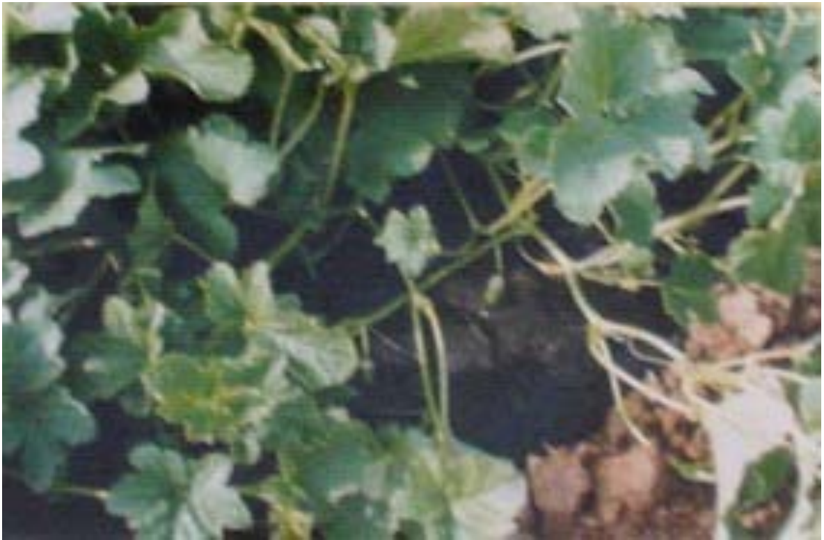
AFTER THE HOMEOPATHIC SPRAYS