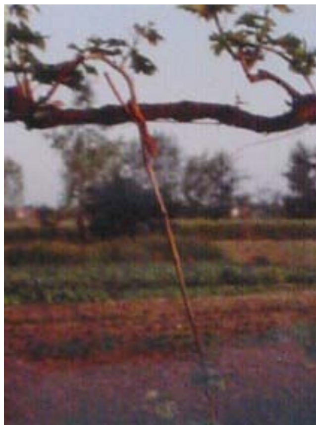
VINES DAMAGED BY FROST (- 5°C)