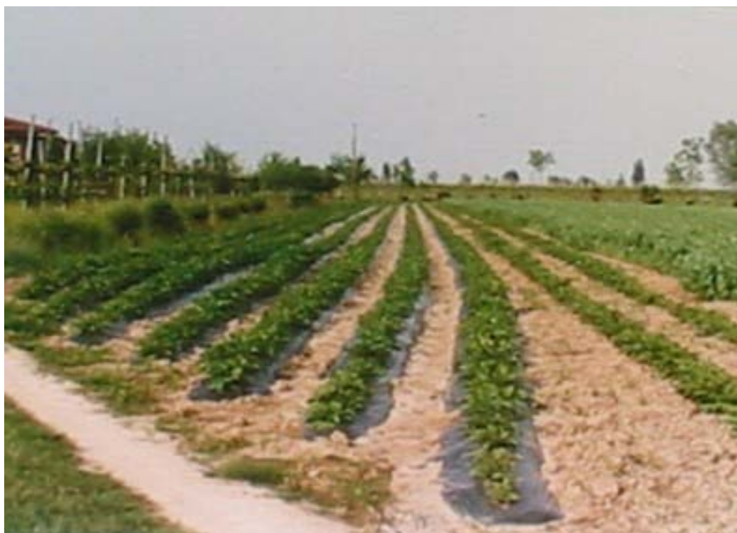
AFTER THE HOMEOPATHIC SPRAY