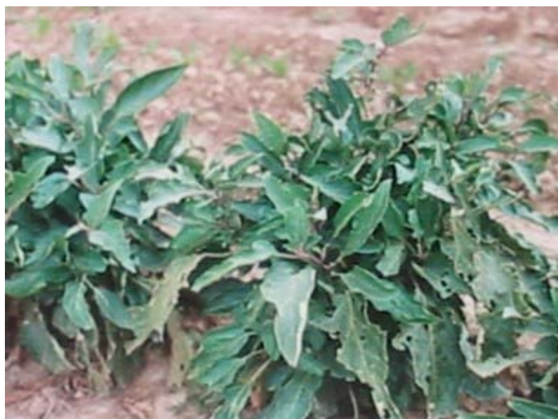
AUBERGINE'S RECOVERY AFTER THE TREATMENTS WITH THE HOMEOPATHIC PRODUCT "ANTI DORYPHORA"