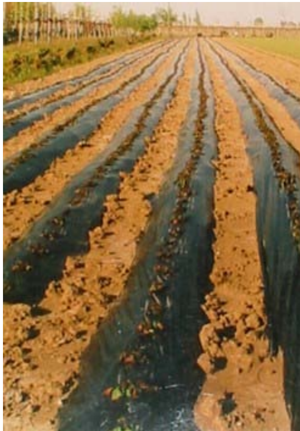
POTATOES DAMAGED BY FROST (- 5°C)